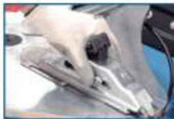
10"-24" ADJUSTABLE CLAMP