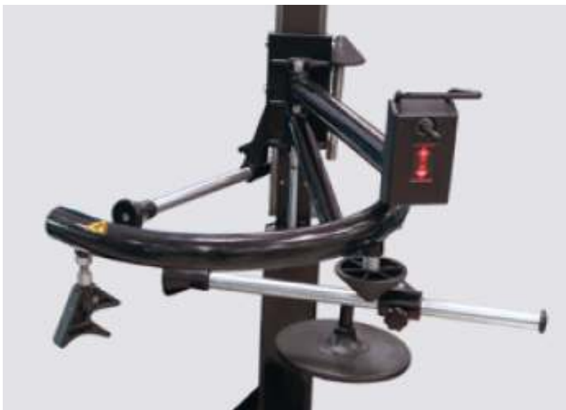
PLUS 73 HELPING ARM